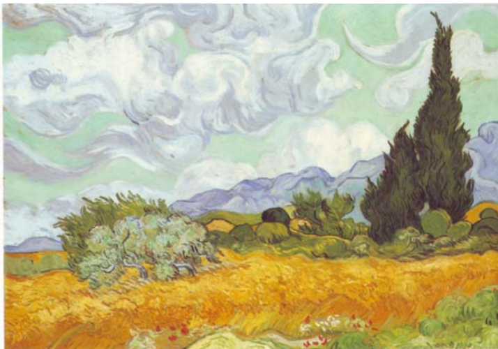
Cornfield with Cypresses, (1889)